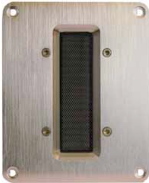
Fig1 CQ76 Front View